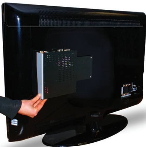
NTB620-mini No TV Capture

The NTB620-mini is a small form factor player, ideal for mounting behind screens or enclosing inside interactive units such as kiosks and outdoor signage displays.